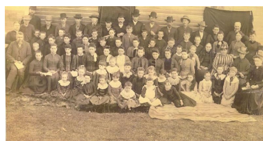
The Kinney School